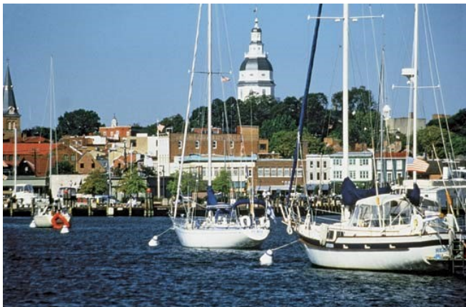
Downtown Annapolis from the Harbor.

Local Restaurants: See the Visitor's Guide.